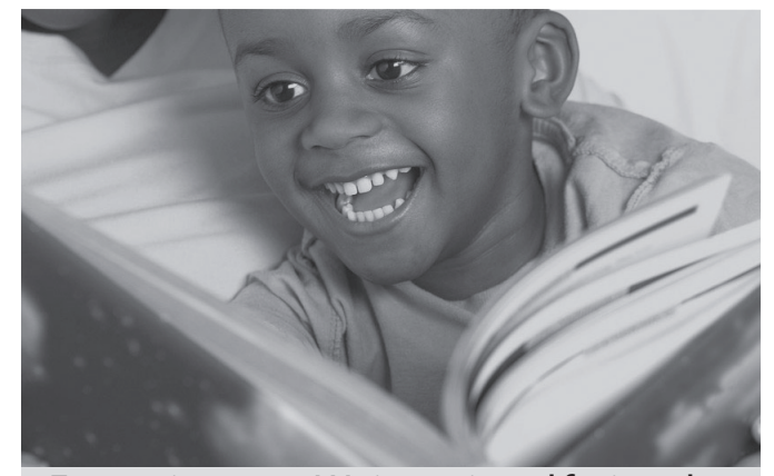
Experience Writes itself in the Anatomy of the Brain -

This is the third revision of the Kansas Early Learning Standards. The first document was completed in 2006 with a second revision done in 2009. Similar to previous revisions, the current work focused on updating the standards based upon new knowledge and research and the need to align the Kansas Early Learning Standards with the K-12 College and Career Ready Standards. As occurred in past years, the early childhood community worked collaboratively and intensively to develop a high quality and useful document that will be helpful to all early childhood care and education professionals, as well as supporting the work of the K-3 teaching community. Kansas early childhood leaders have worked together over many years and on a wide variety of projects. This document is another result of the extensive collaboration that is a part of the Kansas early childhood education community.