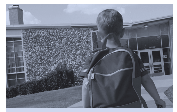
Children are born with an innate urge to connect with the people and things in the world.

Young children need to learn about and understand life within their families and communities. Part of living is understanding family life, the impact of culture and how to live and eventually work together for the good of the community and themselves (i.e., how it all works). 'Social studies' includes learning about the world in which one lives - and understanding how one's family and community fit into a larger world of the state and the country. Young children need to begin their social studies within their own family and progress to understanding about how other families, larger groups or communities work and influence their lives. Through daily life experiences, children will begin to understand the impact of weather, the use of money, how they are making choices and accepting consequences, and the concept of time and what it means within their lives. Young children need to understand how life 'works' and how to incorporate that understanding into daily choices.