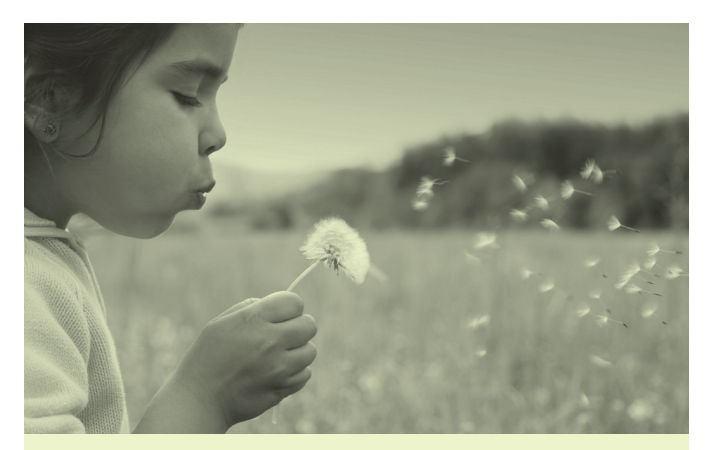
Children are naturally curious. The desire to question, hypothesize, explore and investigate is part of their very being.

Science learning provides children with the opportunity to explore, investigate and problem-solve. Through children's science explorations, they learn to record and document their observations of changes, identify patterns and discuss relationships to help build understanding. Science feeds the curiosity of children - and the scientific problem solving of investigative play supports and enhances children's learning, helping them to better understand their world. Using a curriculum aligned with the science standards adults can provide these experiences through intentional teaching. Children at all ages need to learn a variety of age appropriate strategies to safely explore their world.