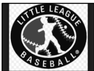
Little League Practice