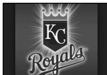
Professional Team Practice